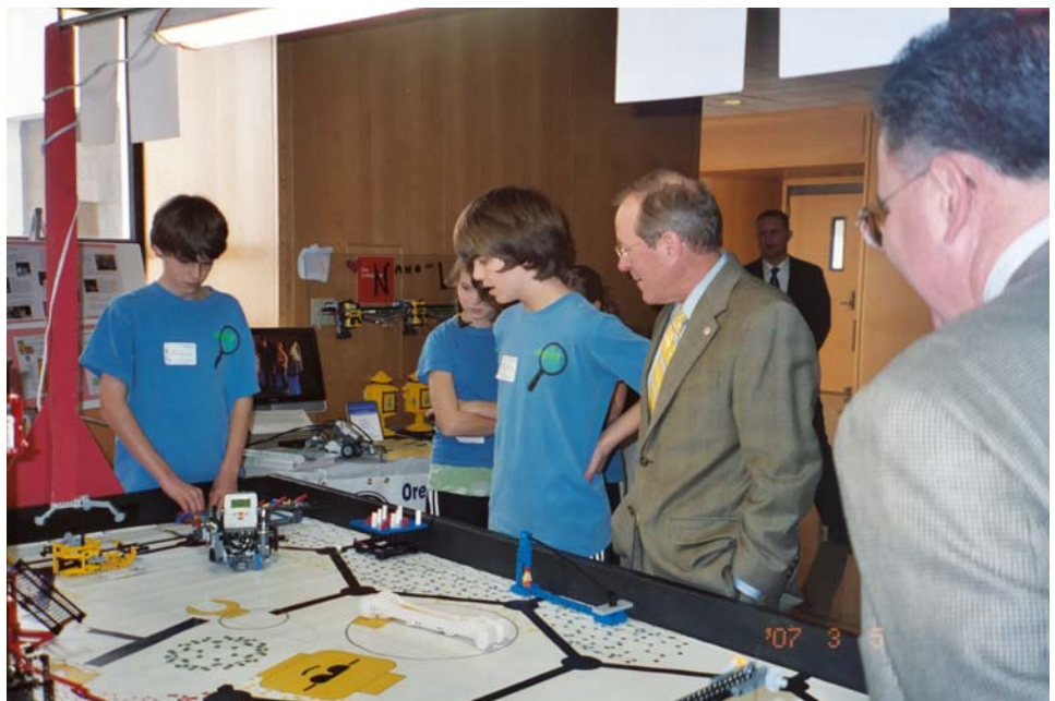
Governor Kulongoski views exhibit during ETIC day at the Capitol

HB 2614: Establishes Oregon Collaborative for Educational Excellence. Directs collaborative to provide system for professional development of teachers and administrators. Establishes Oregon Collaborative for Educational Excellence Board to govern collaborative. Directs board to appoint executive director and advisory committees. Establishes Oregon Collaborative for Educational Excellence Account. Continuously appropriates moneys in account to Department of Education for purposes of collaborative. Appropriates moneys from General Fund to Department of Education for collaborative. Declares emergency, effective July 1, 2007.